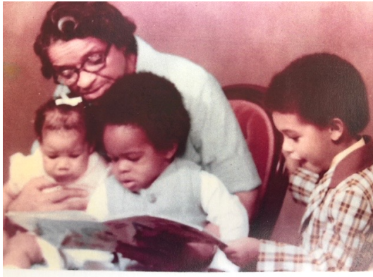
Continuing on to the next generation

Matt 25:21 'Well done, good and faithful servant! You have been faithful with a few things; I will put you in charge of many things. Come and share your master's happiness!'