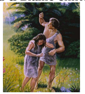
Gen 3:12 Then the man said, "The woman whom <u>You</u> gave to be with me, she gave me of the tree, and I ate.