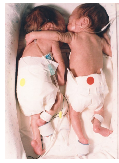
Psalm 103:11-12 New Living Translation

A struggling newborn improved dramatically after being placed in an incubator with her healthy twin sister.