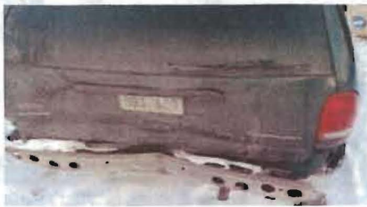
What the Insurance Co. called "Totaled"

At the KU Med Center, I was blessed, because they treated me like a human being. They gave me a hug and said that they would "take care of me here". Before every test my mother and I prayed for everything.